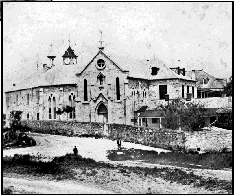
San Antonio's Ursuline Academy designed by Giraud, now the Southwest Craft Center.