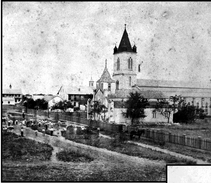
Castroville in the 1880s, the first St. Louis Catholic Church (c.1845) at far left; the second St. Louis Church in center foreground; and the most recent St. Louis Church, built 1870, on the right.