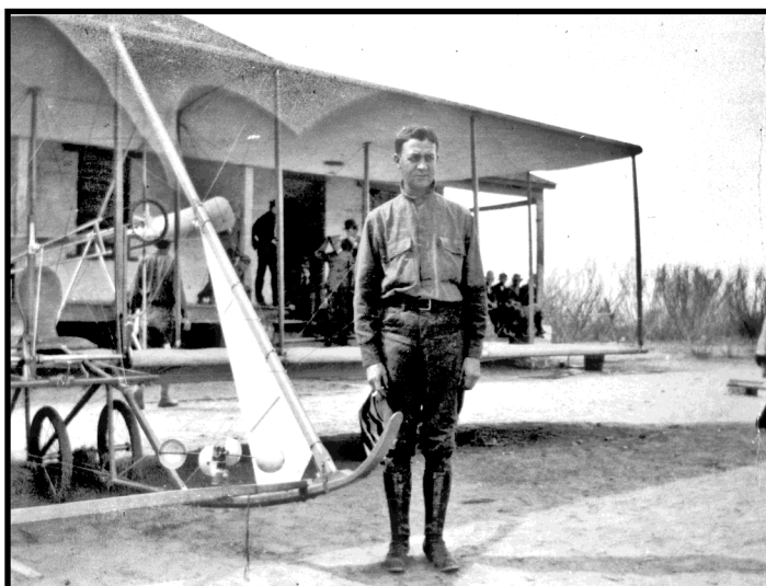
Benjamin Foulois with the No. 1 Wright Pusher airplane, Eagle Pass, 1911—He soloed in a Wright Type B at Ft. Sam Houston in 1910 and by 1915 commanded the newly formed First Aero Squadron, which was to develop into the world's greatest air force. He was the first American to fly in combat (during Pershing's expedition against Pancho Villa in Mexico) and was chief of the Army Air Corps from 1931 to 1935.

Today, Texas organizations such as the Alliance Française celebrate Bastille Day, preserve spoken French and French foods, and serve as reminders of the French influence in Texas as well.