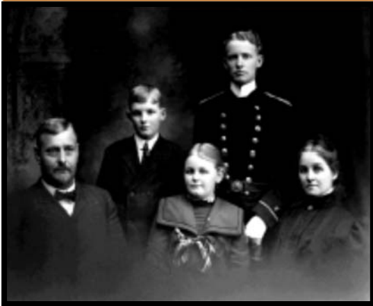
Chester W. Nimitz (in his U.S. Naval Academy uniform) with his family