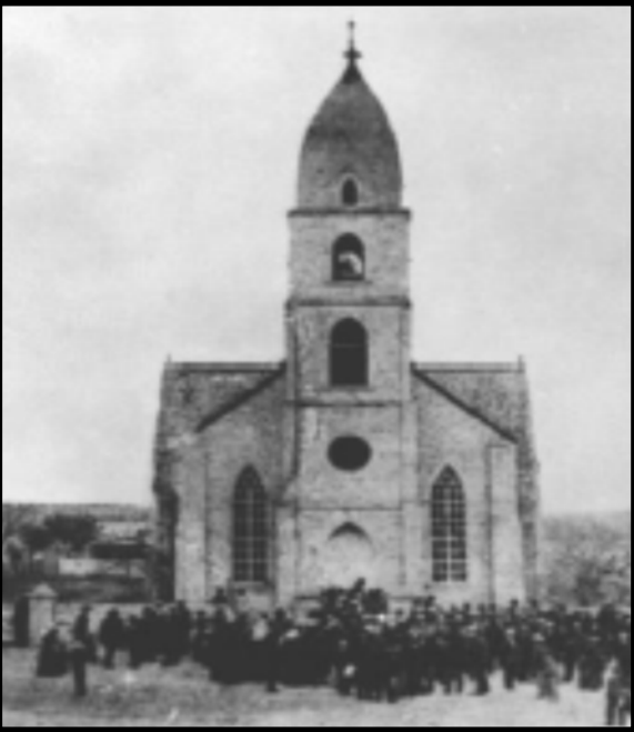
The Marienkirche in Fredericksburg, begun in 1860

At one of the old locations, some have seen and heard a ghost who, beyond doubt, dates back to the settlement days. Ghosts are not unusual in Texas, but this one speaks fluent, academic Latin.