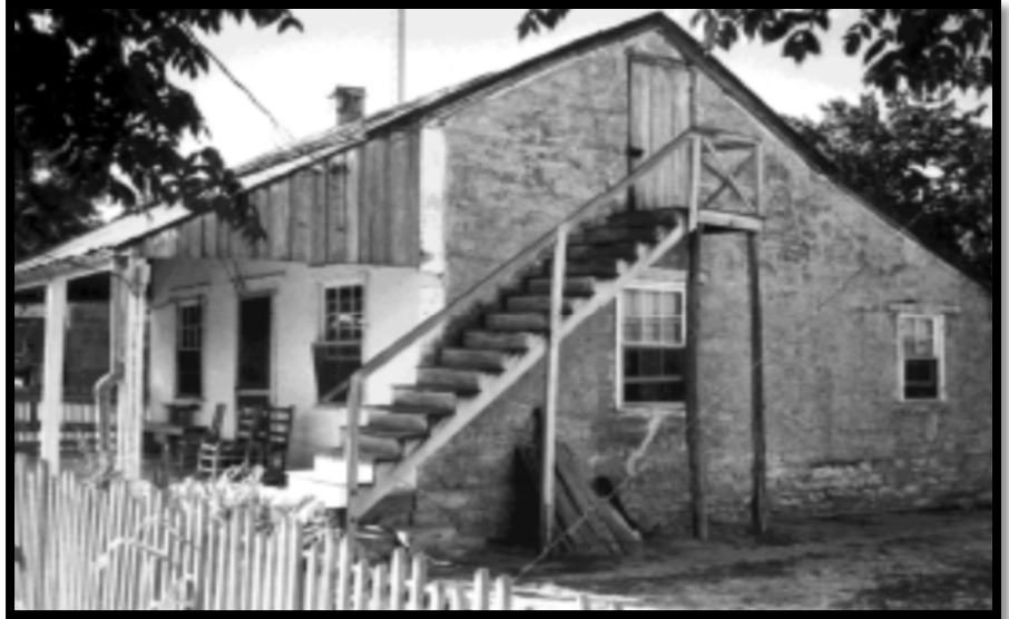
A Sunday house in Fredericksburg.