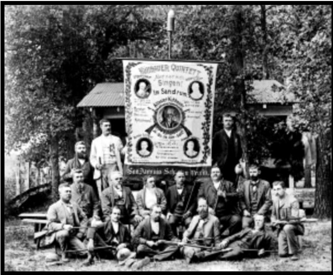
San Antonio Schützenverein (shooting club), c. 1890

German immigrants, attracted to colonial settlement in appreciable numbers and relatively isolated from others—the necessities for cultural preservation—maintained certain customs and most of the language.