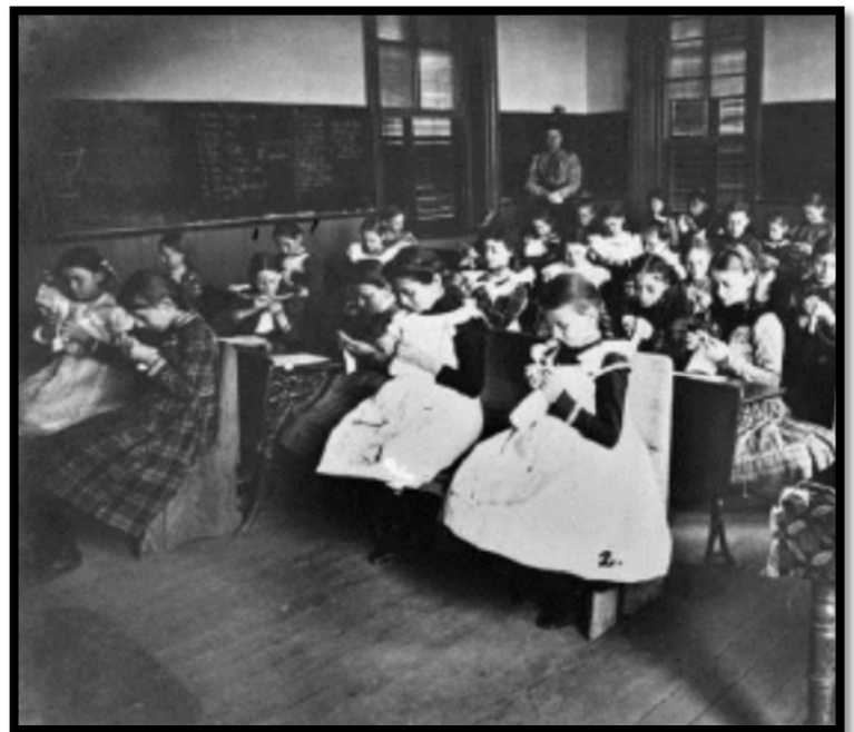
Girls in sewing class, German-English School, San Antonio, c. 1895

A central part of Texas's Hill Country is still called the “German Hill Country.” German food, family customs, and remnants of architecture and of the language remain.