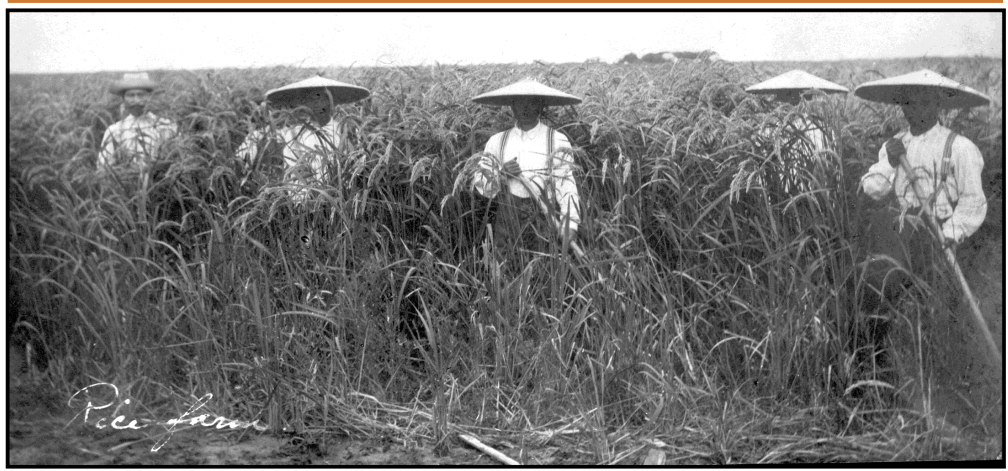
Rice workers on a farm near the Texas coast wearing traditional Japanese rice-straw hats, 1905

The story of Japanese arrivals to Texas is one of the most varied in terms of reasons or motives. Japanese Texans came by choice, invitation, as relocated businesspeople, through government order, and as forced prisoners.